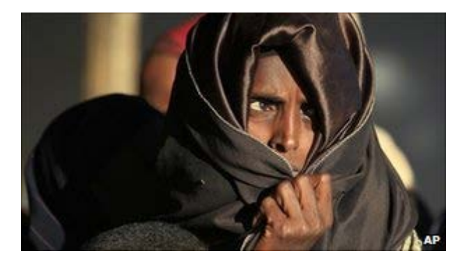
Somalis fleeing to Kenya report that militants at checkpoints have tried to stop people leaving

Uncharacteristically, Somalis have been streaming into camps set up in war-ravaged Mogadishu. Traditionally, city residents have taken refuge in the countryside when fighting in the capital has intensified.