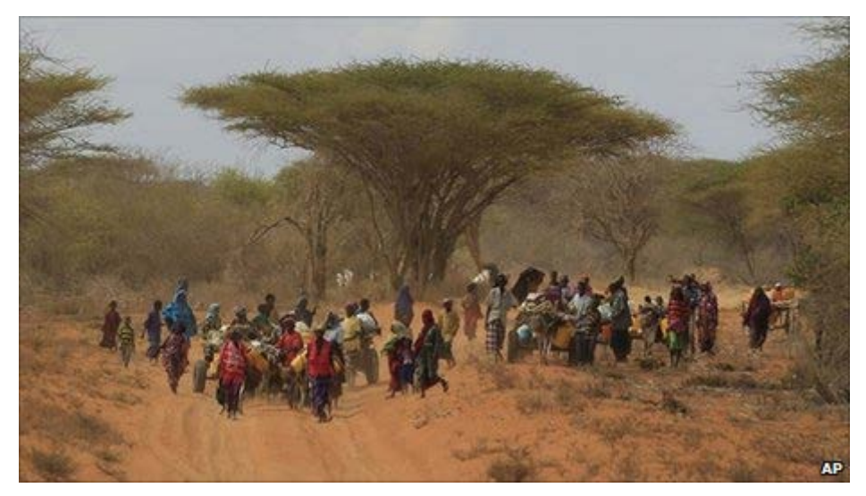
The drought in the Horn of Africa has thrown the region into even more chaos

More often than not, though, conflict has been a contributing factor at times of hardship.