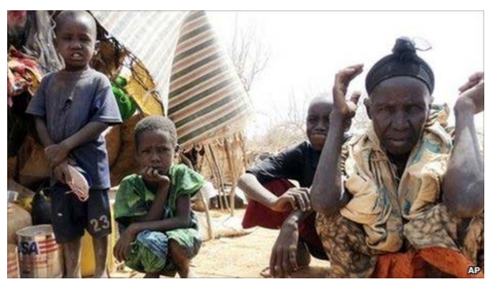
Some refugees have to wait for days to be registered to get assistance

Paul Spiegel, chief of public health with the UN refugee agency - who has been visiting Dollo-Ado and the refugee camps nearby - says the numbers are fluid, but up to 10% of the children are showing signs of severe acute malnutrition.