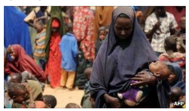
Thousands of Somalis have arrived at Kenya's Dadaab refugee camp in recent weeks

It often takes pastoralists at least two years to recover from a severe drought, particularly where it means building up a milking herd again.