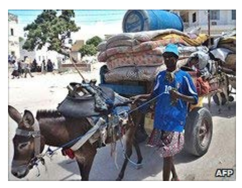
Somalis live as nomads as they constantly flee fighting

Can we walk the 100m (109 yards) between the ministry of information and the prime minister's office then? Not without flak jackets and an armoured vehicle.